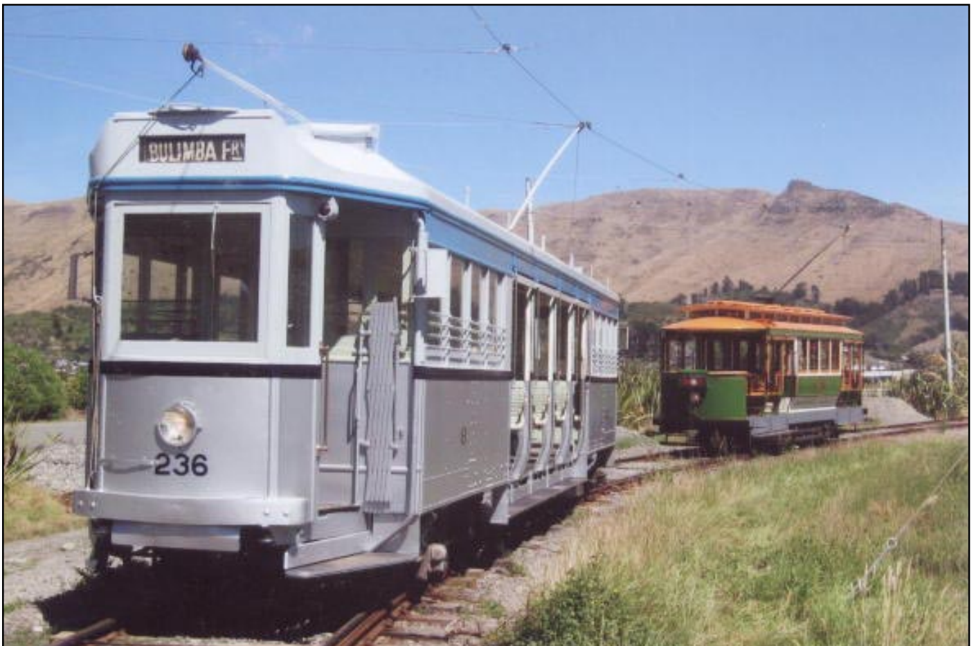
Brisbane No 236 and Christchurch No 1 rounding the big curve on the way back from the township on 1 March 2007.

question is: why is it not using the bridge? The bridge was not new when the Brills appeared so it is not a case of it being incomplete. I did not realise that the line around the bay was retained in full working order after the bridge was completed. Can someone please dispel this editorial ignorance?