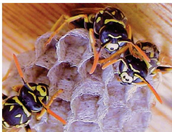
Figure 1 Badge of status. Polistes dominulus wasps show variation in the number and brokenness of spots on the clypeus, above the mouth. Tibbetts and Dale 1 find that these measures provide an indicator of how dominant or subordinate an individual is; dishonesty brings social costs.

Also interesting is that the correlation of spot number or brokenness with head width is very weak, accounting for only 7% or 3% of the variance, respectively. A reliable cue of condition should account for more of the variance. Perhaps head width is not the best measure of condition, and perhaps the clypeus marks are actually correlated with a better, as-yet-unknown measure. But the marks are fixed in the pupal stage, and are not altered by later feeding and overwintering, which are known to affect condition. It seems that if clypeus marks are status badges, they are not conventional ones.