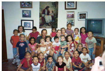
"This experience will be forever engraved in my heart."

I can't believe that God allowed me to return to El Salvador so soon (twice in one year)! This trip was like the first trip, in the sense that I saw similar places, we shopped at the same tourist market and we were even going to see the Mayan ruins which I saw previously (but they were closed). But, at the same time it was a completely different experience.