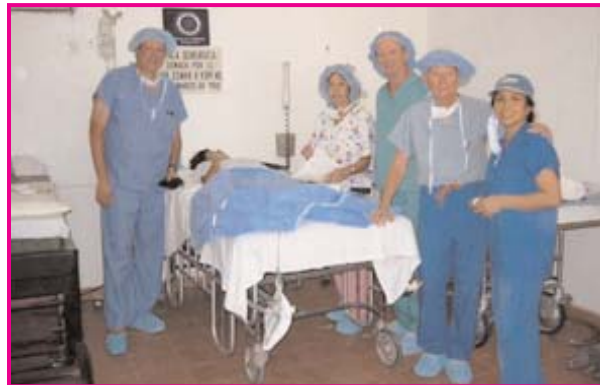
In an operating room in El Fuerte, Mexico, volunteer surgeons and medical students pause from their work.