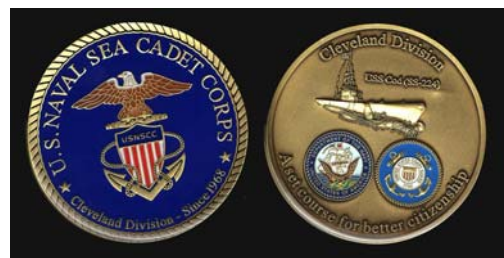
Challenge Coin for NSCC