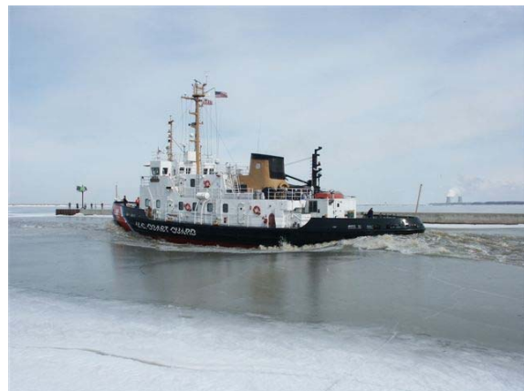
Neah Bay cutting through some ice