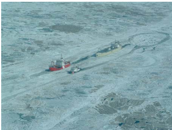
Neah Bay helping a small cement carrier outside of Buffalo.