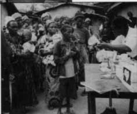
(right) She instructs a young male patient on how to take the medicines he receives.

Until recently, we have not focused much attention to the medical needs in the villages in Afikpo. Now it has become clear to us that helping those who suffer physical pain is a critical part of our calling. We express our appreciation with hearts full of thanks to World Opportunities International (WOI), Hollywood, California . Since 1998, WOI has freely and generously donated helpful medicines and nutritional supplies to help Bountiful Harvest address this health care need.