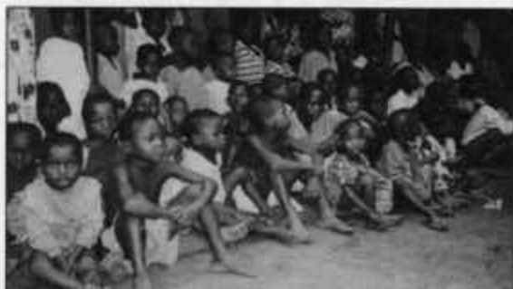
Nkpogoro Village - LIGHT children sat quietly and listened attentively to the missionaries' teaching.