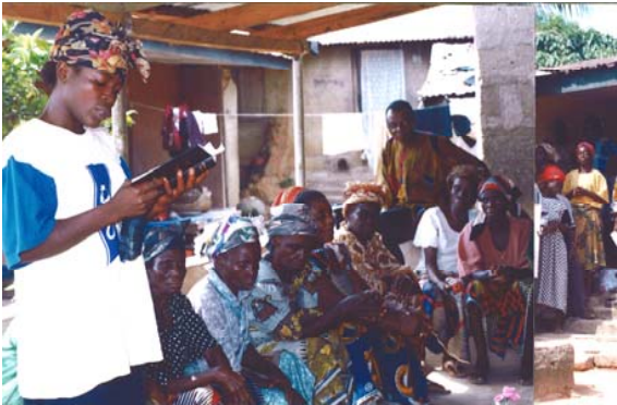
The True Vine Evangelistic Outreach TEACHING THE WORD

Prophet Isaiah used the above verse in reference to those who brought the news of exiles’ deliverance from captivity in Babylon. (Isaiah 52: 7). Apostle Paul applied the verse to the messengers of the Gospel (Romans 10:15). As my favorite evangelism verse , it always brings to my mind, the image of those pioneer missionaries, and some present day missionaries . They travel miles on feet, (some barefooted), up and down the hills and mountains, trekking along winding, and narrow dusty paths to bring the Good News of God’s love, to people living in the remote ends of the earth. How would anyone see those weary, battered and dusty feet of these missionaries as beautiful?