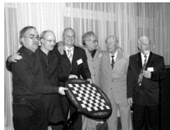
World Champions at the ICCF Congress, Dresden, October 2007